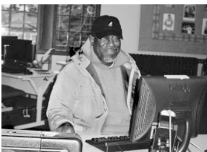
The computer lab at North Portland Neighborhood Library is popular with users of all ages.