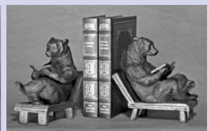
Fill up a bag with a pair (or more) of whimsical bookends from the Friends' Library Store.