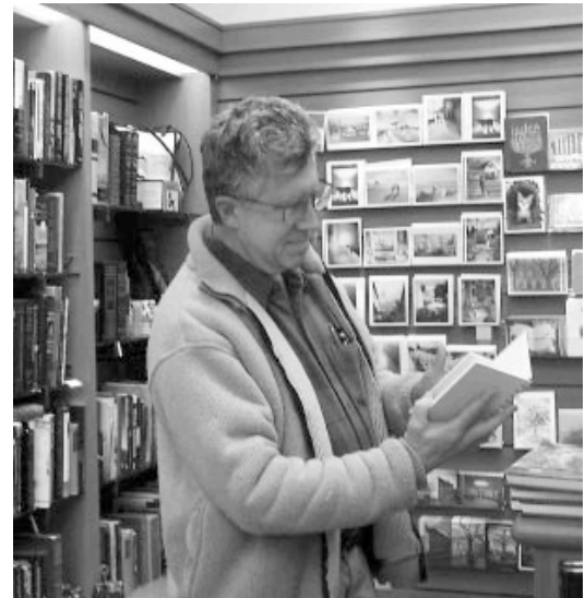
Books, cards and gifts – we have them all at the Friends' Library Store!

The Friends' Library Store is having Double-Discount Days for Friends members December 5 – 10 . Please visit the store during these dates for 20% off your purchases of used books and gifts. If you need to renew or are not a member, you may become a member at the store! I'm looking forward to seeing those members who don't often get downtown to the Central Library.